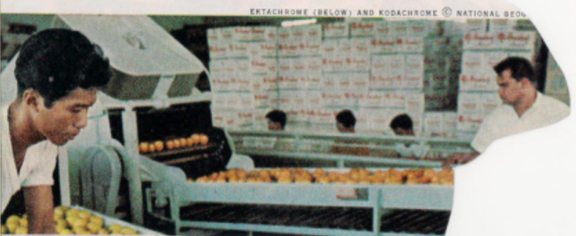
EKTACHROME (BELOW) AND KODACHROME © NATIONAL BIRD

without exhausting him. The dog must remain on a preselected course determined by his handler, and must not range out of control of whistle or hand signals or voice. The pointer's nose must quickly locate birds; the dog must not approach so close that the covey flushes prematurely. He must hold the point—remain stock still—at the report of the gun, until ordered to move again.